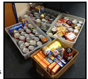
Food donations from students and staff over the last 24 hours

Garretson's next action comes as the home opener against Colman-Egan on Tuesday, September 9.