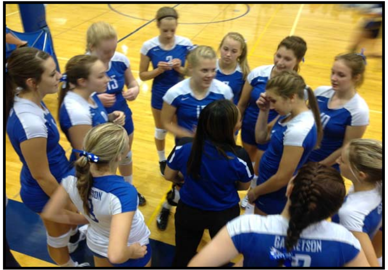
Lady Blue Dragons in the huddle preparing for their upcoming set

Beating the second ranked team in the third set was a huge boost for